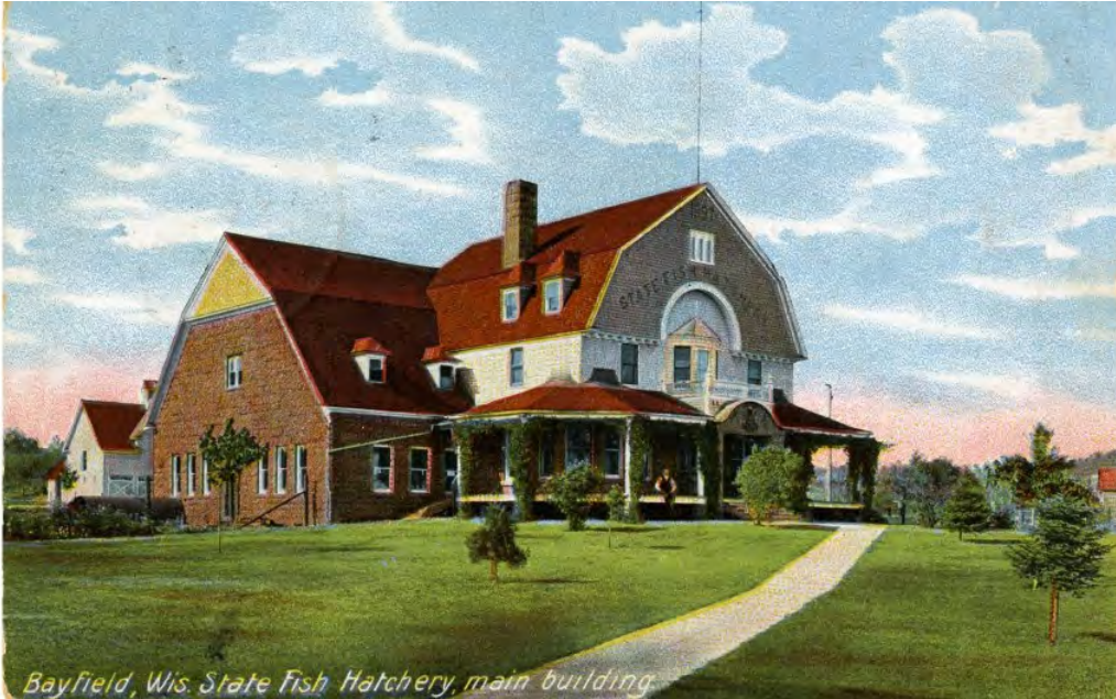
Bayfield, Wis. State Fish Hatchery, main building.