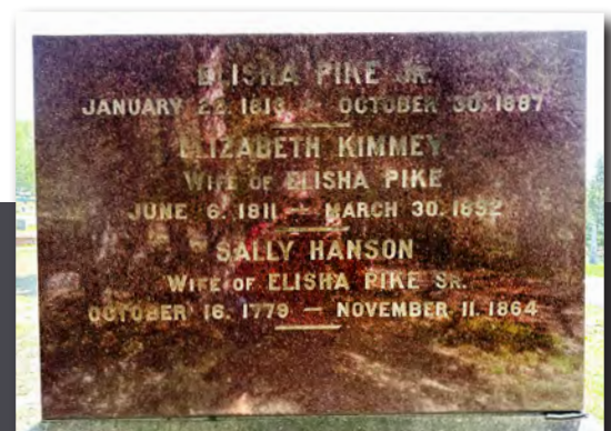
Pike Family Gravestone