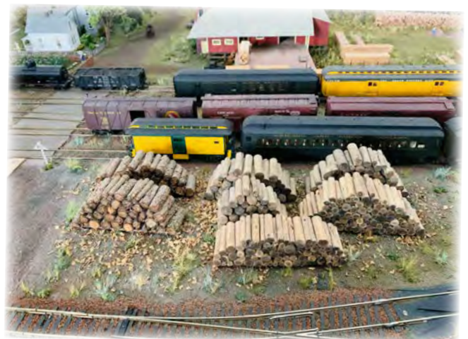
Bayfield Model Railroad exhibit

Museum Volunteer Orientation in May (date TBD): as you plan your summer months in Bayfield, consider volunteering 3 hours a week at BHA! Training is provided and you will meet many interesting visitors.